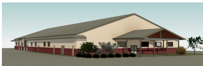
Renderings by Seth Murray, Seth Murray Architecture